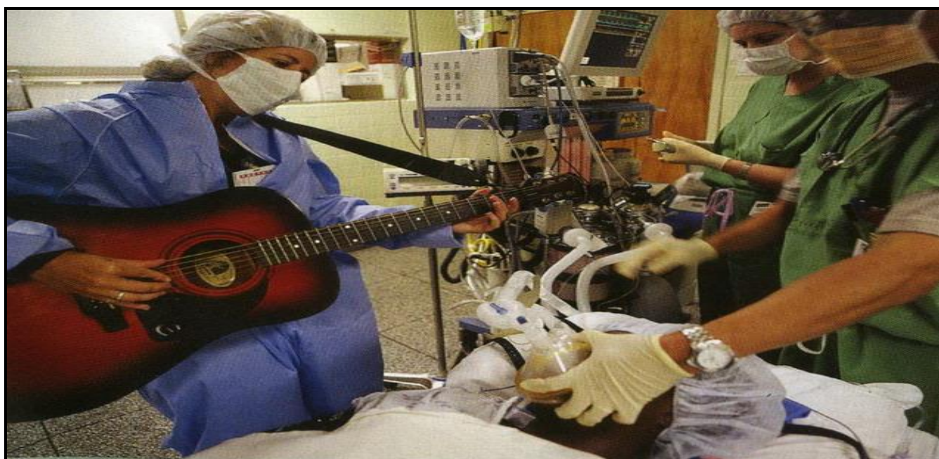
Figure 1: Music Therapy in Pain or Distress Management. In the UK, music therapists are trained to master's level and is registered with Health and Care Professions Council as allied health professionals [68].

Pain causes stress, and stress affects pain control chemicals in the brain, such as norepinephrine and serotonin [69-71]. Behavioral approaches /relaxation training can help reduce muscle tension and stress, lower blood pressure, and control pain [72-75]. Physical therapy should strongly be considered for the management of chronic pain to gradually increase flexibility and strength. Adding cognitive behavioral treatment (CBT) component to routine physical therapy reduces NSCLBP, disability and depression, fear of movement with enhanced of self-efficacy, enhancing