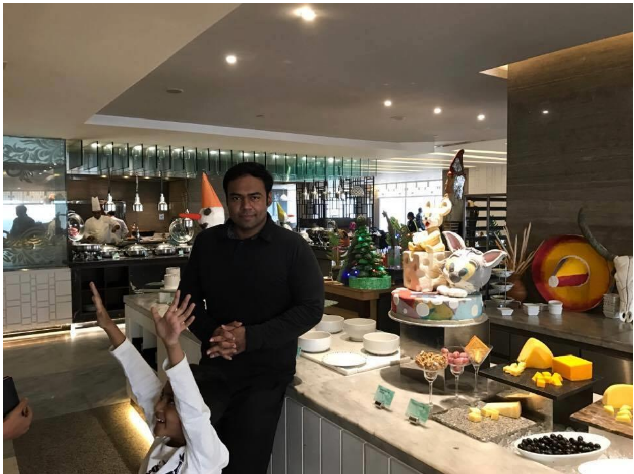
Figure 2: The Author