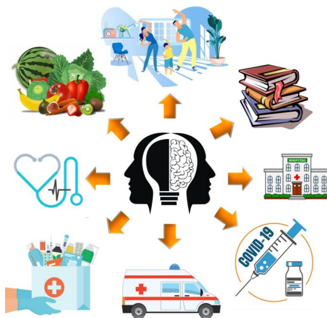
Figure 1: Graphical Abstract Health Literacy

LHL, physicians are typically unaware of their patients' health literacy levels and their subsequent effects on their patients' outcomes.